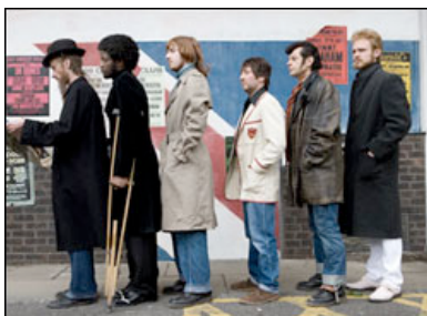
'sex & drugs & rock & roll'